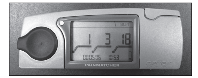
Figure 2) The Pain Matcher (Cefar Medical AB, Sweden) is an instrument for electrical stimulation that provides constant current stimulation despite variable skin resistance. The electrical charge per second is extremely low and causes no tissue damage. The intensity value (0 to 99) is directly related to the pulse width and is displayed on a liquid crystal screen

Pain perception was assessed using an electrical stimulation device, the Pain Matcher (23,24). The device provides constant current stimulation despite variable skin resistance. It is controlled by a microprocessor, which provides rectangular pulses at a frequency of 10 Hz and an amplitude of 10 mA. The stimulus intensity is increased by raising from zero to a possible maximum of 396 (in increments of four) over a total of 99 steps. The electrical charge per second is extremely low and causes no tissue damage. The intensity value (0 to 99) relates directly to the pulse width and is displayed on a liquid crystal display screen (Figure 2). The